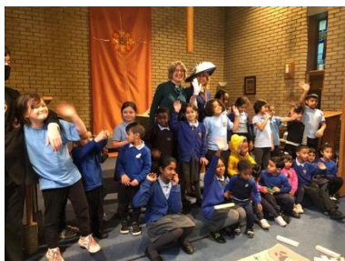
The High Sheriff visits Pop- up Café