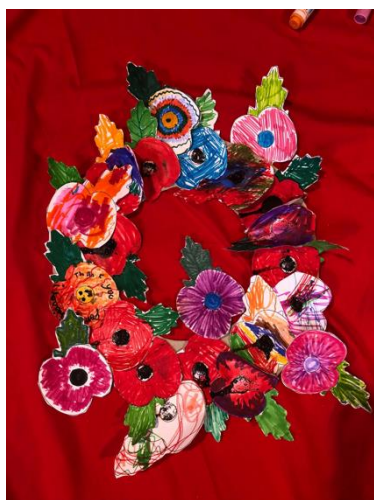
Remembrance Wreath made by the children at Pop-up Café

Because of the close contact we have with a number of families who have moved out of Sheerwater to other parts of Woking, we feel we may have the basis for starting a regular baby and toddler group. This needs planning and resourcing. It will also need helpers, including some of more senior years, to offer a grandmotherly or grandfatherly presence.