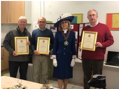
The High Sheriff presents community awards to the Mascot team